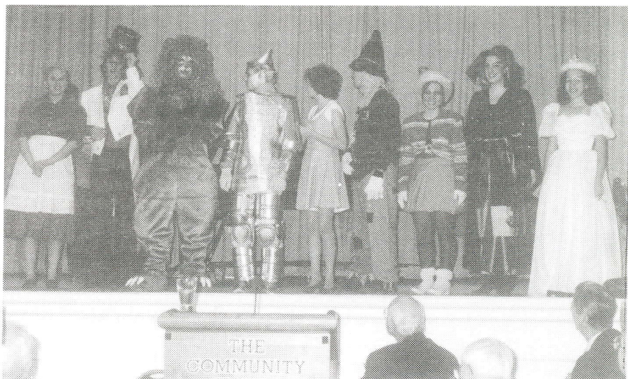
Birmingham Seaholm students presented selected musical numbers from "The Wiz" at the meeting of March 5. Club members responded with enthusiasm both to the costumes and the performances.