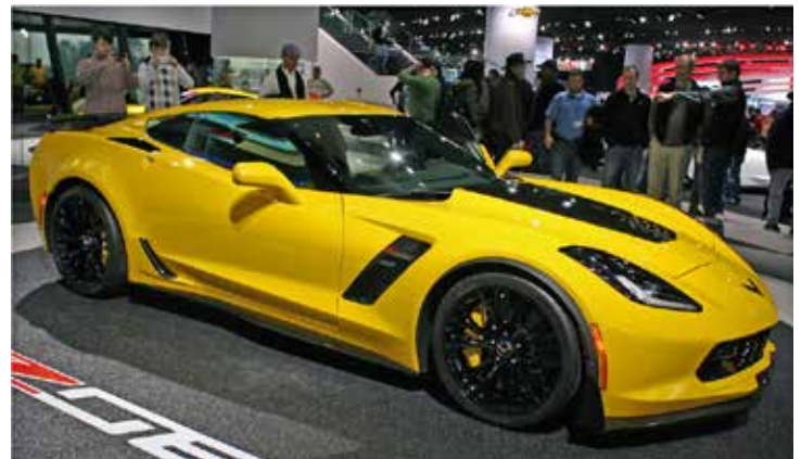
New Corvette Z06—North American Car of the Year