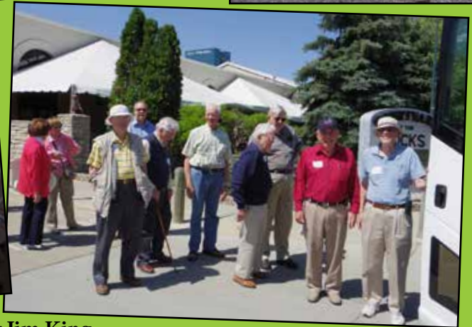
MudHen trip