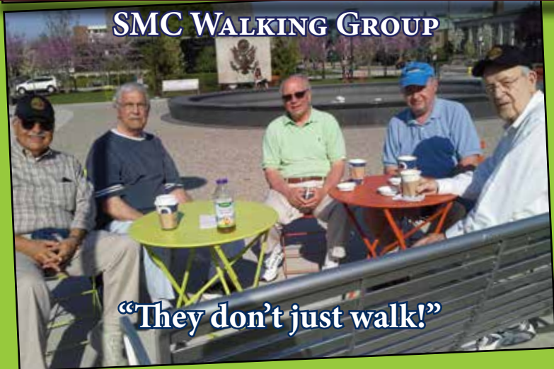
"They don't just walk!"

Way to go! Sporting the SMC logo at a Tigers game